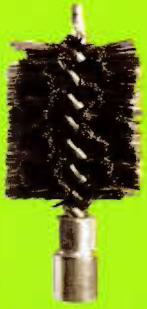
"DS" for removing light scale and burnishing all types of tube