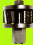
"H" TYPE for Cleaning straight and curved tube