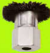
"TH" for soot removal from smoke tube, general cleaning